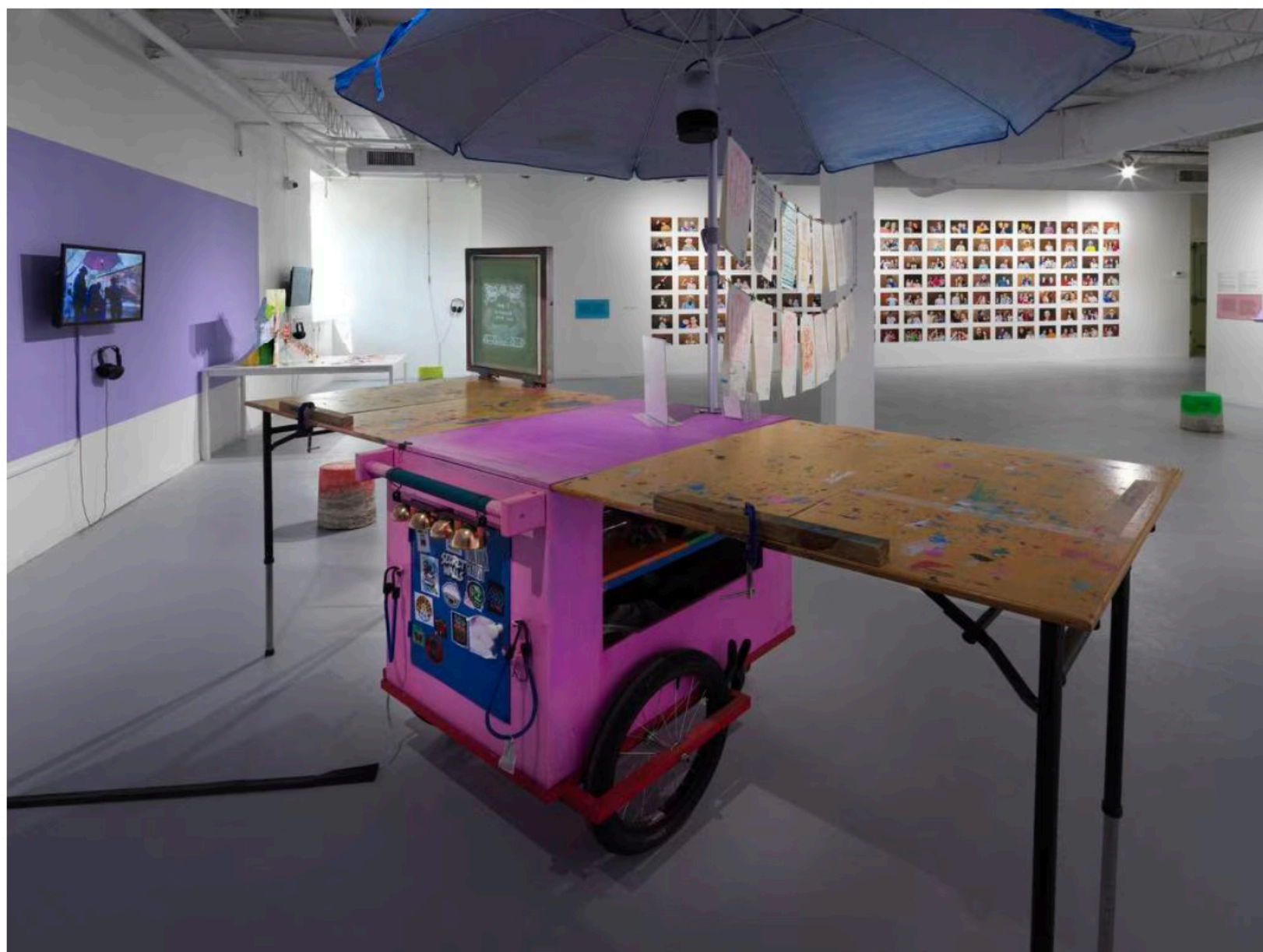
Installation view of "William Estrada: Multiples & Multitudes" at Hyde Park Art Center.